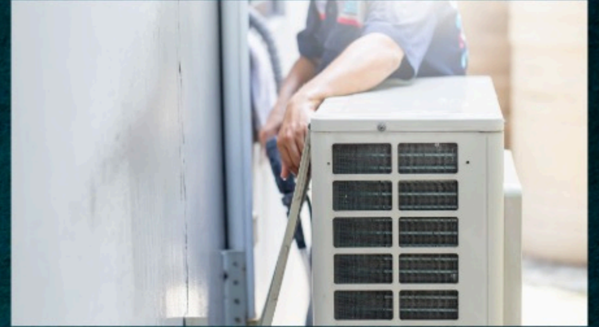
Air Conditioning Holder