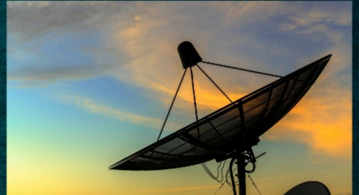
Central Satellite Dish