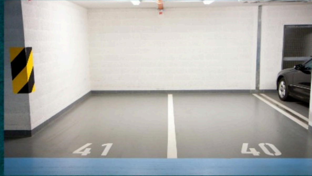
Garage and Storage